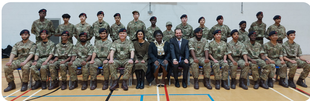
Our CCF cadets with the Mayor of Wandsworth during their Pass Out parade

Students at Ernest Bevin Academy regularly comment on how much they enjoy the extra-curricular offer.